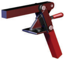
527 Flanged Base